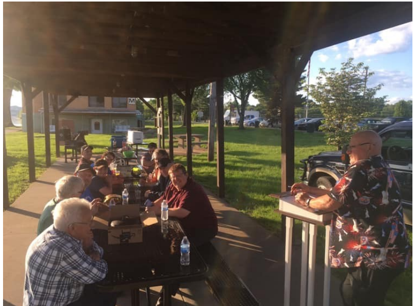
Men's Fellowship enjoy each other's company at their May meeting at the Riverfront Park.