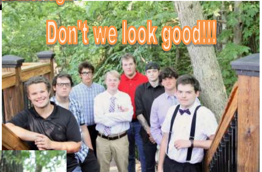
Don't we look good!!!