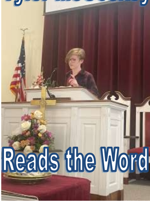
Reads the Word