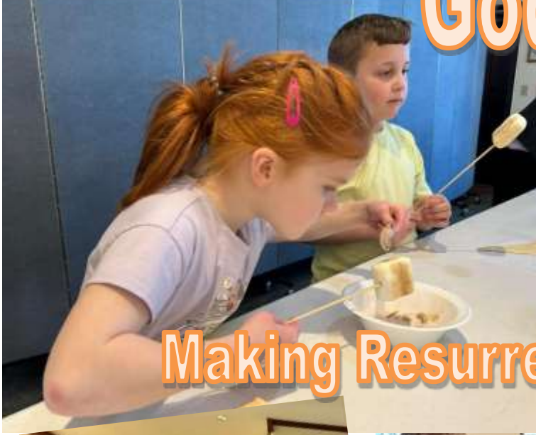
Making Resurrection Cookies!