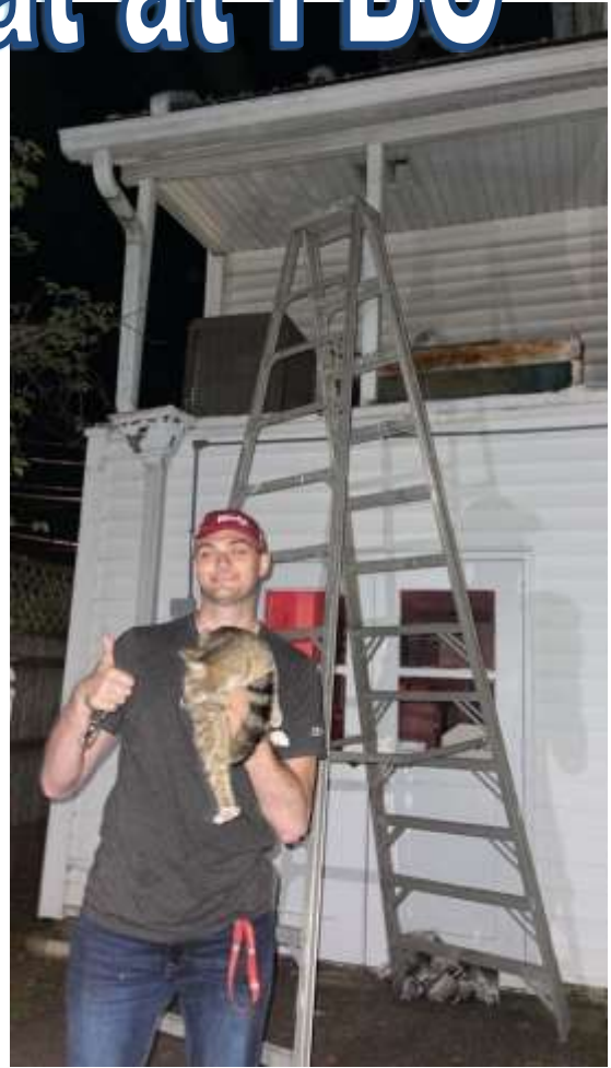
Helping God's creatures