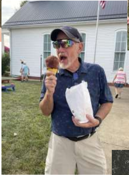
Danny Home Made Ice Cream