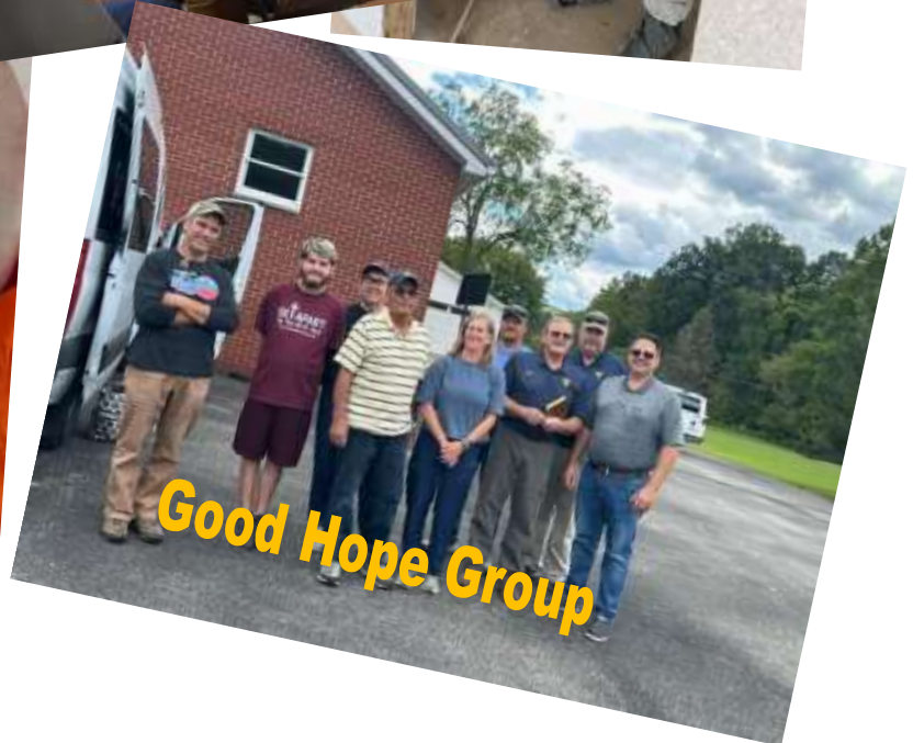
Good Hope Group